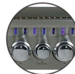
Optional LED light