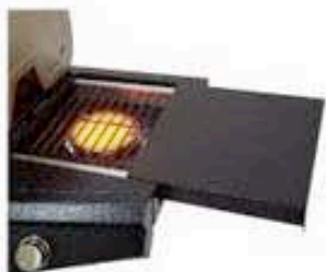
Infrared side burner