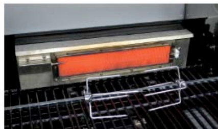
Infrared back burner Rotisserie fork not included